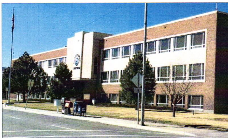
Bannock County Courthouse, Pocatello, Idaho